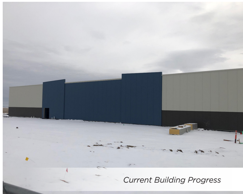
Current Building Progress