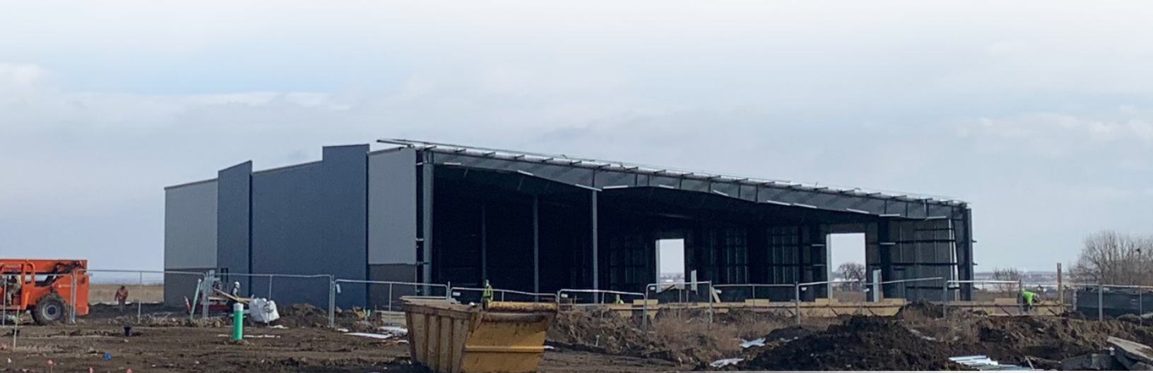
Current Building Progress