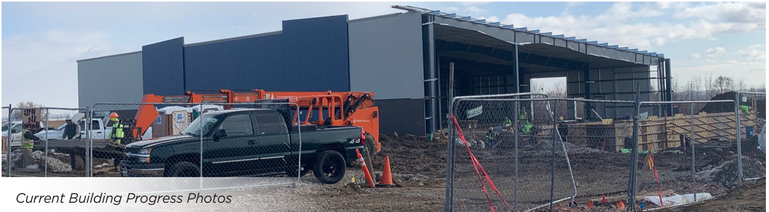
Current Building Progress Photos